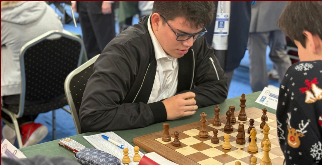
!FIDE WORLD JUNIOR U20 CHAMPIONSHIPS 2025